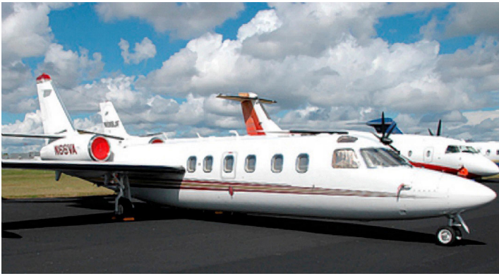
Westwind Engine Intake Plugs