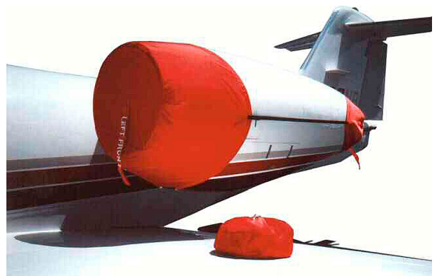
Lear 30 Tri-Fold Engine Cover