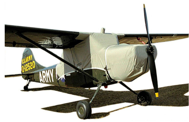
Cessna L-19 Canopy & Engine Covers (similar to Siai Marchetti 1019)